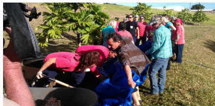
(Above) WCCC inmates and Honolulu Garden Club Members shovel mulch under 'Ulu trees.

"According to Breadfruit Institute find-