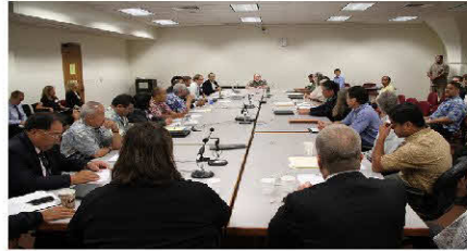
JRI Working Group meeting to discuss comprehensive plan to improve Hawai'i's justice system.

• Optimize the pretrial process through more timely assessment of risk for flight and re-offense and earlier determination of suitability for pretrial