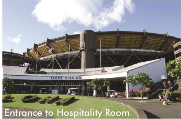
Entrance to Hospitality Room