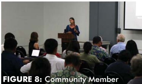
FIGURE 8: Community Member

The primary purposes of the meeting were to offer members of the community an additional opportunity to make their voice heard by the OCCC Team and the island-wide community and to provide feedback directly to the team to be used as part of the Final EIS effort. Towards that end, the majority of the evening was given over to the public who offered verbal comments covering a wide variety of topics including the need for additional programs and services to help offenders reintegrate into their communities, the role of state-sponsored task forces and commissions studying approaches to reforming the criminal justice system in Hawaii, and concerns over the possible cost of developing a new OCCC among other issues and concerns (Figures 7 and 8). Those unable or unwilling to speak were offered comment cards to allow for written comments that were reviewed by the OCCC Team following the meeting for inclusion in the EIS process.