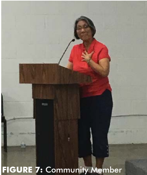
FIGURE 7: Community Member