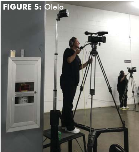
FIGURE 5: Olelo

Ms. Mehnert also described the project timeline; planning began in 2016 and will continue through the end of 2018, with approximately two years devoted to facility design (2019 - 2021). Actual construction will likely take a minimum of 2 years (2021–2023).