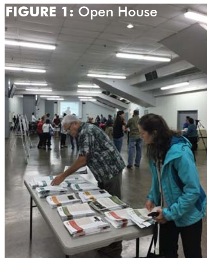
FIGURE 1: Open House

A hallmark of the planning and environmental study process has been the commitment to openness and inclusiveness; in keeping with that approach, PSD and DAGS hosted a Town Hall meeting concerning the proposed OCCC project and the Draft Environmental Impact Statement (EIS). Individuals representing agencies, organizations and neighborhoods throughout Oahu attended the Town Hall meeting held November 29, 2017 at the Aloha Stadium Hospitality Room. The meeting brought together leaders of PSD and DAGS and their consultants to present information to an audience interested in the future of OCCC. The meeting also provided the public with a forum from which to offer comments and input concerning the Draft EIS for the proposed OCCC project. An Open House preceded the formal public meeting where members of the public could interact with representatives of the OCCC Project Team to share information, receive answers to questions concerning the proposed project, and offer their thoughts and insights (Figure 1).