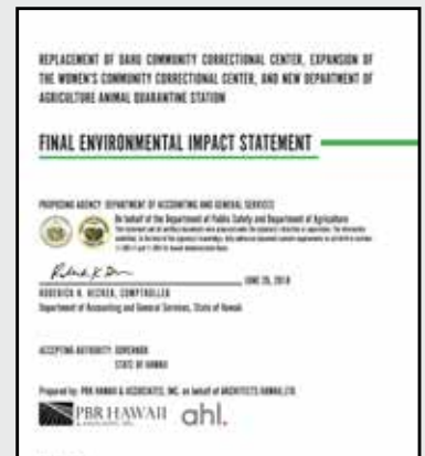
Cover of the FEIS

Diverse groups of elected officials, government agencies, stakeholders, and the public-at-large shared comments and questions during the 60-day public comment period for the Draft EIS. More than 250 individuals, 12 organizations, 15 federal, state and city/county agencies, and 7 elected officials submitted written comments and questions to PSD and the Hawaii Department of Accounting and General Services (DAGS) concerning the proposed OCCC project and the Draft EIS in addition to comments received during the Town Hall meeting held on November 29, 2017. Since the end of the comment period (January 8, 2018), PSD, DAGS and the Consultant Team have completed responses to the comments and questions for inclusion within the Final EIS along with necessary updates or revisions to technical information contained within the Draft EIS.